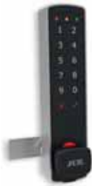
CH/EL Electronic lock