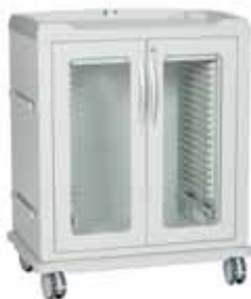
Aluminium structure with glass