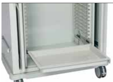
Soft self closing telescopic rails