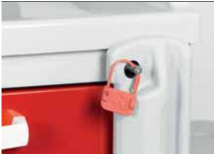
6064 Pack of red and numbered security seals