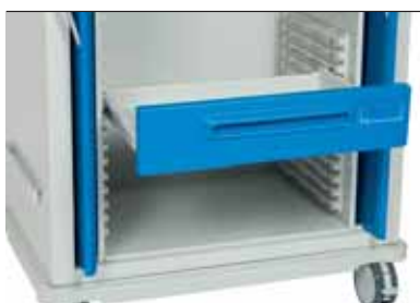
Technopolymer drawer (height 70, 140, 280 mm) complete with label holder