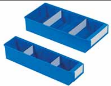
Medication bin with 2 dividers