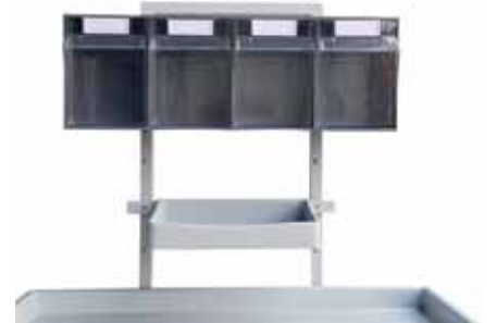
60500 Upstand with 4 tilt bins + 1 removable ABS baskets