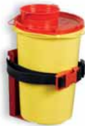
6067 Holder for sharp containers

6042 capacity 10 lt 60424 capacity 20 lt