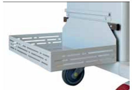
60490 Shelf for special waste containers / compartment for suction machine