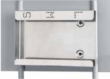
CFS134.35M Triple plexiglass glove dispenser