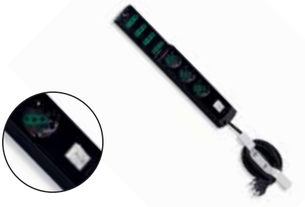
6063 Multiple socket with power cable