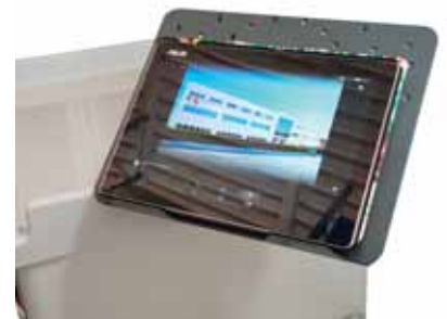
60502 Notebook holder 60503 Tablet holder