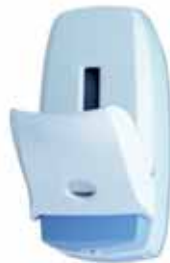
15022 ABS elbow operated soap dispenser