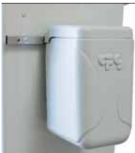
Knee-operated waste bin.

6042 capacity 10 lt 60424 capacity 20 lt