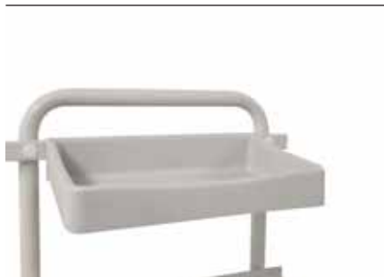
CFS 134.35B Removable bin fixed on accessory rail (dim. 300x180x45h mm)