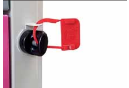
CHS Centralized breakaway lock