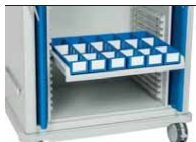
Technopolymer drawer for medication bins Medication bin, dim. 94x400x82h Medication bin, dim. 188x400x82h