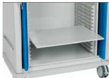
ISO removable shelf 600x400 made of epoxy-painted steel