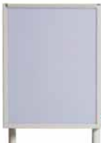
6047 Rechargeable battery-operated X-ray film viewer with battery charger