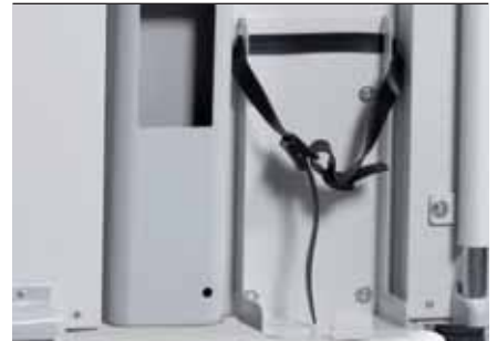
60663 Holder for oxygen cylinder with straps