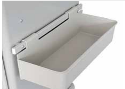
60491 Side storage compartment