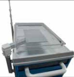
60501 Adjustable and 360° swivel tray for defibrillator