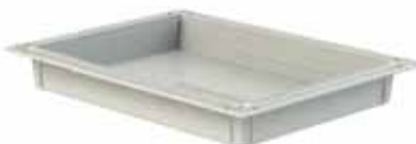
ISO tray 600x400 (height: 50, 100, 200 mm)