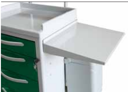
6043-1 Removable side additional shelf fixed on accessory rail