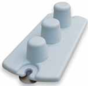
60493 Medicine cup dispenser