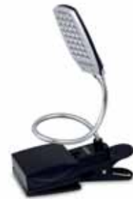
60497 Battery-operated lamp