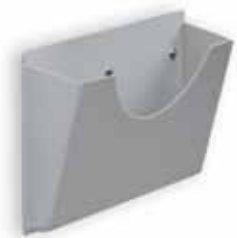
CFS134.10 Side compartment for documents