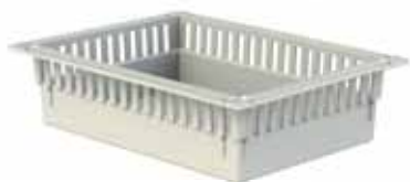
ISO basket 600x400 (height: 50, 100, 200 mm)