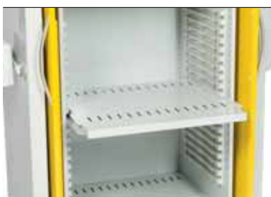
Shelf for the positioning of maximum 16 files