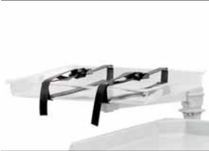
6060 Set of straps for defibrillator tray